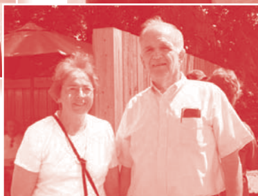
Congratulations to our 4 gas card winners!